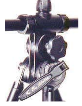
SCCTB or MACCTB Standard Series or Major Series Center Column Tilt Bracket