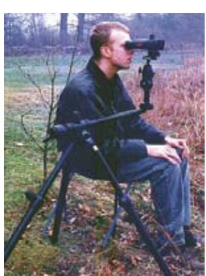
Major System Tripod